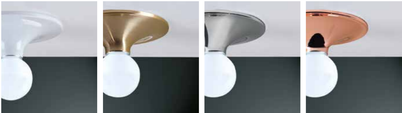
.01 Bianco - White .25 Dorato satinato - Satin gold .31 Cromo - Chromed .38 Rame lucido - Shiny copper